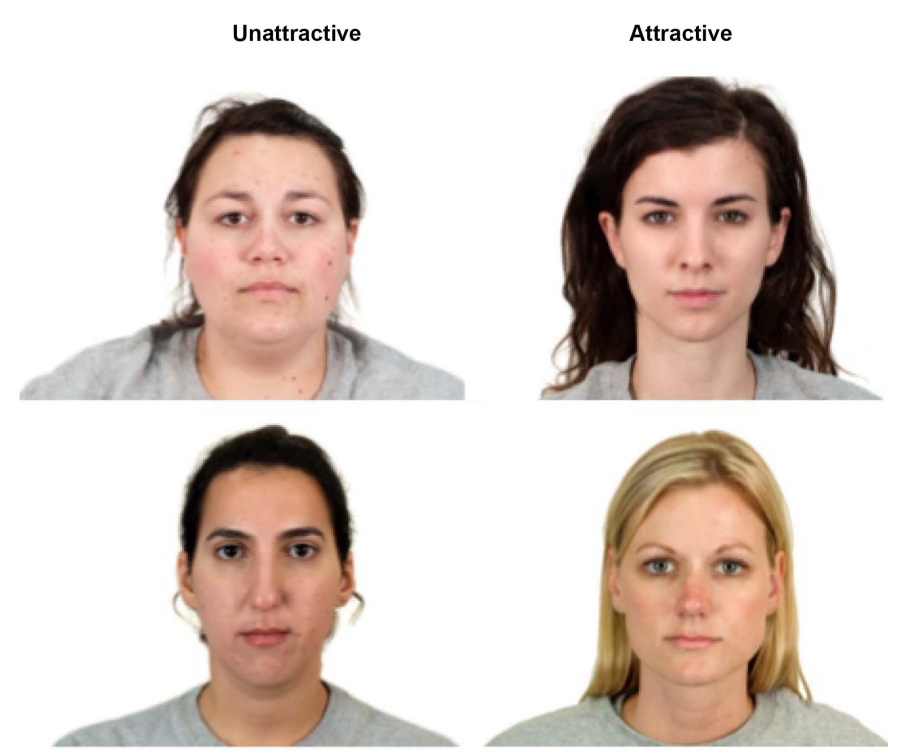
Figure A1. Original face stimuli.