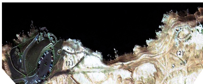
Figure 15. Mirador del Rio artillery batteries—(1) 1 st artillery battery; (2) 2 nd artillery battery.

A circular artillery emplacement (33) (29°12'57.68"N, 13°28'42.46"W) about