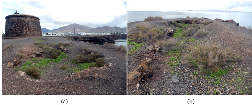
Figure 8. Ground emplacement (8)—(a) General view, on the foreground Castillo del Águila on the left and Playa Blanca; (b) Access trench, on the foreground Lobos and Fuerteventura.