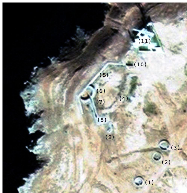
Figure 17. Mirador del Rio 2 nd artillery base—(1) circular artillery emplacement (32); (2) circular artillery emplacement (33); (3) circular artillery emplacement (34); (4) embankment (35); (5) three sided barrier wall (36); (6) oval artillery emplacement (37); (7) trench (38); (8) buried bunker (39); (9) small construction (40); (10) cistern (41); fort or modern house (42) (ZoomEarth).