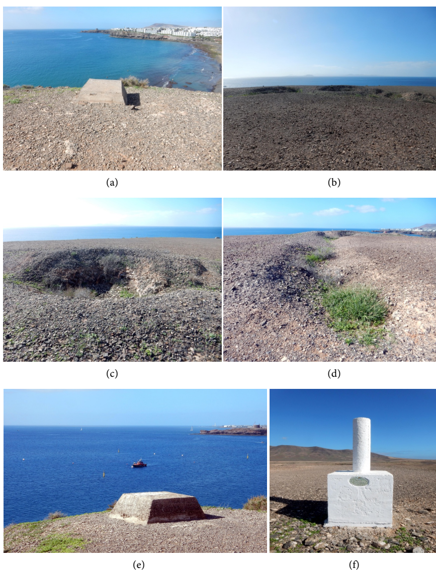
Figure 10. (a) Truncated, pyramidal base (13) General view, in the foreground Playa Blanca and Castillo del Águila; (b)-(d) Ground emplacement (14); (e) Truncated, pyramidal base (15), in the foreground Castillo del Águila; (f) Geodetic stone (16).

A well preserved, white painted geodetic stone (16) ( Figure 10(f) ) formed by a cubic base with a superimposed cylinder. An oval, green plate on the base informed: