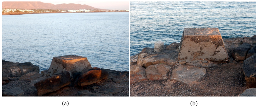
Figure 3. Truncated, pyramidal base (2)—(a) General view, on the foreground Playa Blanca; (b) Thin concrete layer covering portions of the side surfaces.