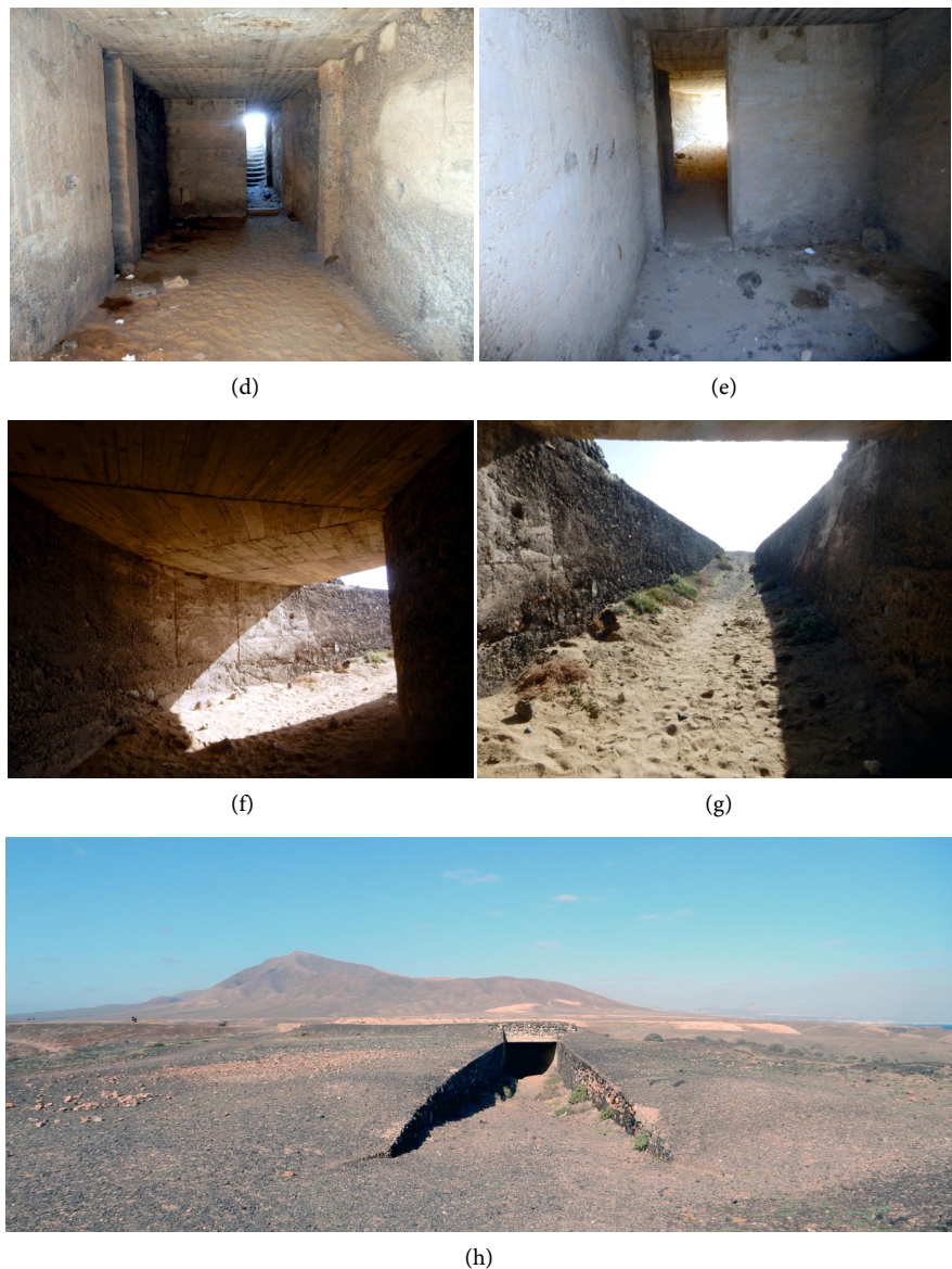
Figure 14. (a) Bunker (27) general view toward south; (b) Square pit and access stair; (c) Access stair with upper front side formed by rounded magmatic stones; (d) 2 nd room with protruding square columns and niche, in the middle, separation wall and access stair; (e) 2 nd room, on the left wall three curved fixation for a disappeared support or device, in the middle separation wall; (f) Curved exit; (g) Exit ramp with protective walls; (h) Bunker (26) general view toward north.

and a niche on the opposed wall. On one wall three, curved fixations joints and on the opposite wall four holes indicated disappeared supports or devices. A separation wall provided the entrance to a 3 rd room with walls and ceiling formed by local, small magmatic pebbles mixed with concrete, letting visible traces of the construction formwork. The 3 rd room gave access to a curved passage towards a ramp about 30 m long with protective side walls made by local, magmatic stones. The ramp floor appeared not provided with rails. The bunker interior preserved its original white painting. All the original furniture disappeared and no trace