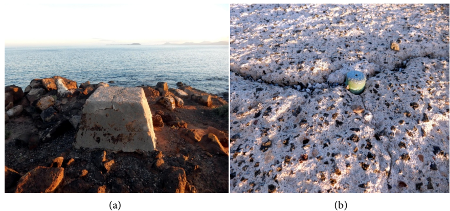
Figure 4. Truncated, pyramidal base (3)—(a) General view, on the foreground, Lobos island in the middle and Fuerteventura island on the right; (b) Local, small magmatic pebbles mixed with concrete and cylindrical, metallic shaft at the centre of the square top surface.

surfaces letting visible traces of the construction formwork. A cylindrical, metallic shaft, about 5 cm in diameter with a central hole slightly protruded at the centre of the top surface.