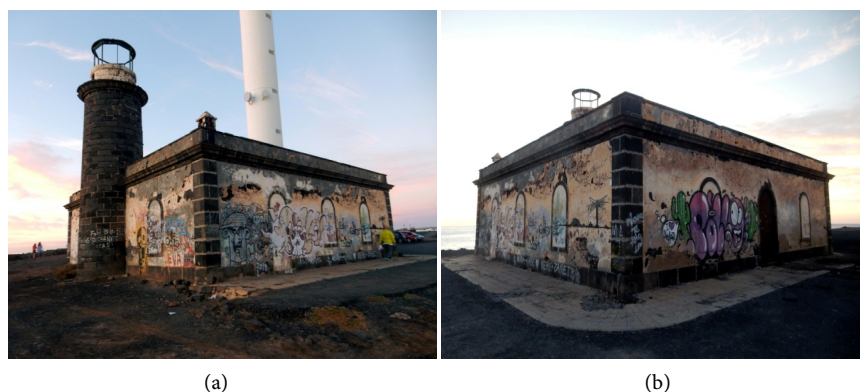
Figure 2. Old lighthouse (1)—(a) South and east facade; (b) East and north facade.

A well preserved truncated, truncated, pyramidal base (3) (Figure 4), 0.5 m high, 1.5 m each side at the base, 1 m each side at the top, built by local, small magmatic pebbles mixed with concrete. A concrete thin layer covered the side