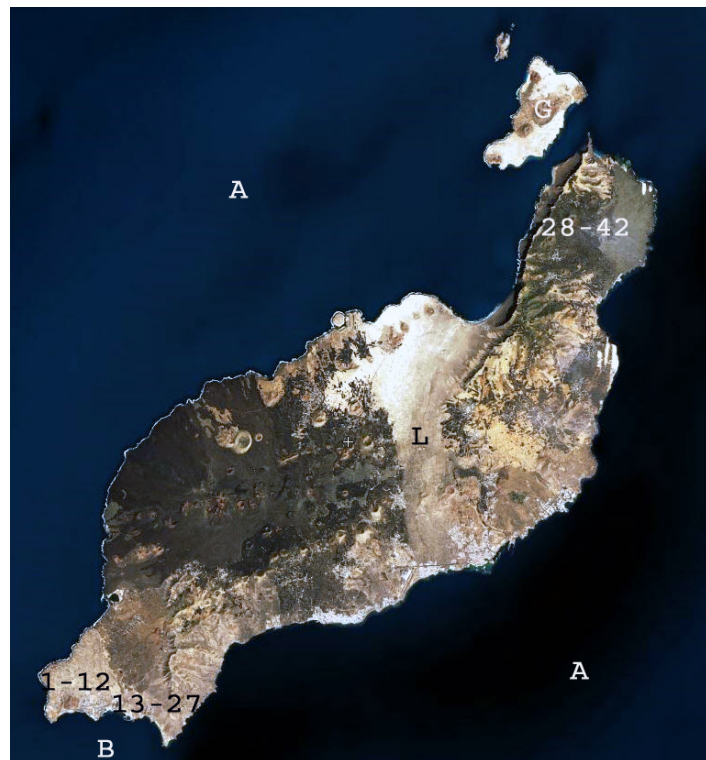
Figure 1. A Atlantic Ocean; B La Bocayna channel; L Lanzarote island; G La Graciosa island; 1 - 12 Playa Blanca coastal defences; 13 - 27 Punta del Papagayo coastal defences; 28 - 42 Mirador del Rio artillery bases.

In Lanzarote the coastal artillery comprised 4 \times 152 mm Putilov guns and 3 \times 107 mm Arisaka guns. The Putilov guns were a Russian version of a Schneider gun. They were sent by the URSS to the EPR during the Civil War. They had a range of 15 km, but their reduced number, their not normalized calibre and the few ammunitions available caused them to be used for the coastal defence and retired in July 1942. In the island were built 75 bunkers, 25 double and 50 single, 56 machine gun nests and 5 casemates. The thick of the casemate walls were 80 cm up to 1 m for those much exposed to enemy landing (Defensa, 2015).