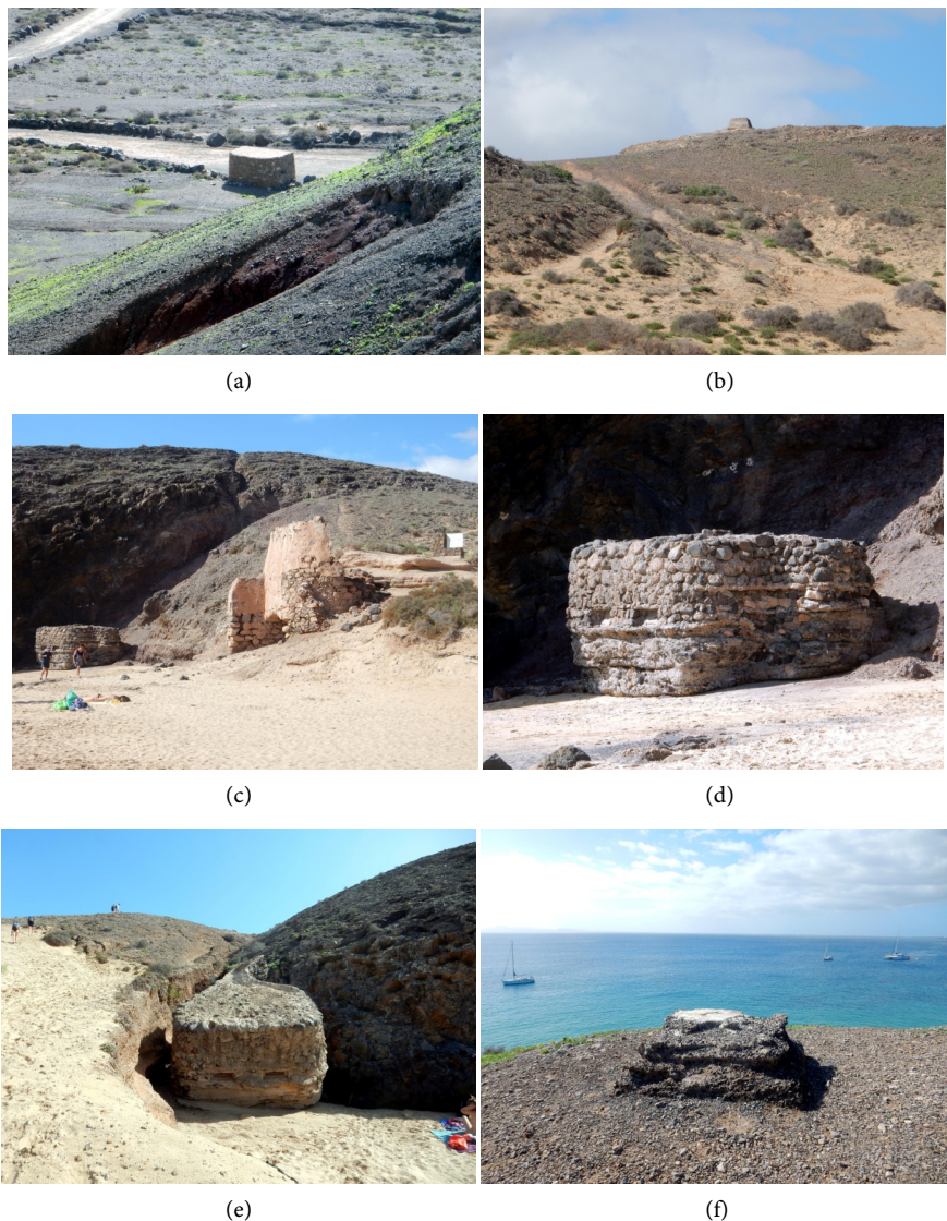
Figure 11. (a) Pillbox (17) near Playa Mujeres, general view; (b) Truncated, pyramidal base (18); (c)-(d) Pillbox (19) at Playa Mujeres near a middle-age guard tower; (e) Pillbox (20) at Playa Mujeres, general view; (f) Truncated, pyramidal base (21).

A well preserved one floor, rectangular pillbox (19) ( 28^{\circ}51'15.22''\text{N} , 13^{\circ}47'