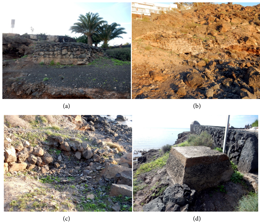
Figure 9. (a) Pillbox (9) front side; (b) Pillbox (10) front side with fire aperture provided with splinter guards; (c) Possible ground emplacement (11) on a side of the pillbox (10); (d) Truncated, pyramidal base (12).