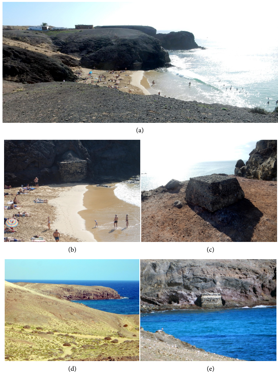
Figure 13. (a) Pillbox (24) general view; (b) Pillbox (24) front view; (c) Truncated, pyramidal base (25); (d) Pillbox (26) general view; (e) Pillbox (26) front view.

A well preserved one floor, rectangular pillbox (24) ( 28^{\circ}50'38.92''\text{N} , 13^{\circ}47'20.21''\text{W} ) ( Figures 13(a) & Figure 13(b) ), about 8 \times 5 m, 2.5 m high leaning