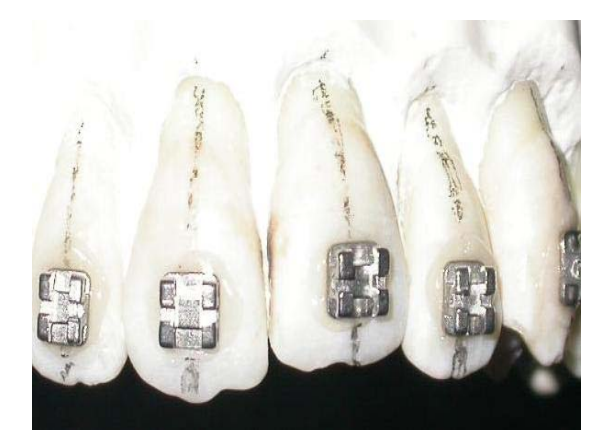
Figure 1. Positioning the brackets on the reference model.

A metal ruler and a protractor scale 0.5 mm were used for linear and angular measures.