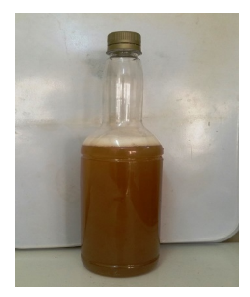
Figure 2. Bessoudioury.

African artisanal methods are essentially a dilution of honey in water, followed by a fermentation step and a clarification step [8] [16]. The dilution reduces the osmotic pressure in the honey and then favors the fermentation step by yeasts. This step is important because osmotic pressure of honey inhibits the activity of the yeasts [6]. This ratio of honey/water varies from 1/1 for "Bessoudoury", 2/5 for the Ethiopian mead "Tej" [17] and 1/3 for the Ethiopian mead "Ogol" [9]. The aim of the cooking step is to eliminate the bitterness compounds, and the autochthonous flora of honey. These flora is such us bacteria (Bacillus, Micrococcus), yeast (Saccharomyces spp.) and fungal (Aspergillus) [6]. This step certainly reduces the risk of spontaneous fermentations. Nevertherless, it may occures the degradation of the thermosensitive compounds such as the phenolic acids and the flavonoids of the honey [18]. Also, there is formation of 5-hydroxymethylfurfural (HMF) which is an intermediate product of Maillard reactions due to high temperatures [19], [20]. The duration of cooking (1 h 30 mn) then justifies the low antioxidant activities compared to the Polish meads where the rate of inhibition of DPPH varies from 30% to 70% [21]. In perspective of the work, it would be necessary to optimize the cooking time of "Bessoudioury".