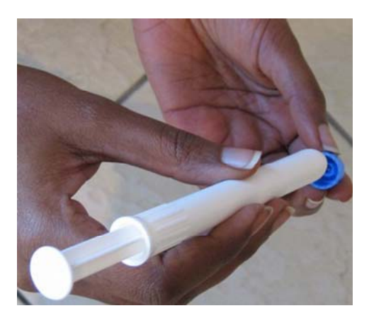
Figure 3. Traditional vaginal applicator.

Therefore according to this study, a single application of the stained vaginal lubricant using the FemCap delivery system has proven to have better acceptability, compliance, gel distribution, and retention than two applications by the vaginal applicator.