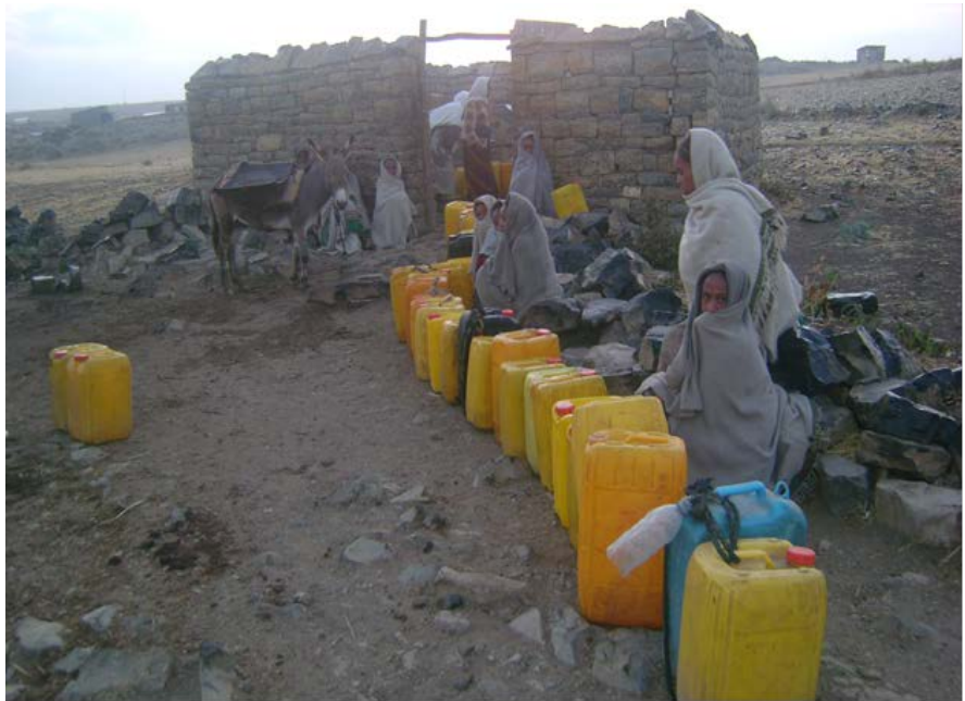
Figure 2. Girls and young women's queue to draw water; photo taken from Meremety.