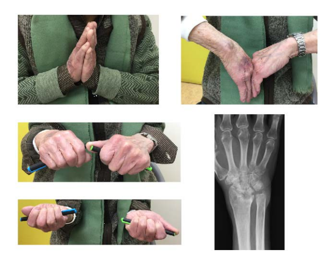
Figure 3. Photographs showing range of motion. Plain radiograph at the final examination (after 13 months).

Pathogenic bacteria : β-Streptococcus group G