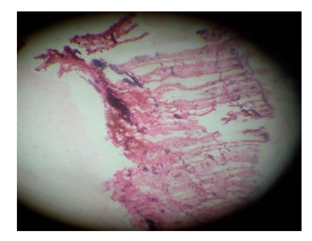
Figure 3. Photomicrograph showing fibrocollagenous tissue with mild hyperplasia and chronic inflammation (H & E Staining).