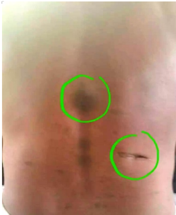
Figure 5. Showing clinical scarring of the spine and parietal abscess.

Both patients have an appointment every month for clinical and bacteriological control during the next two years; Bacteriological control is negative at the 9th month of control post treatment.