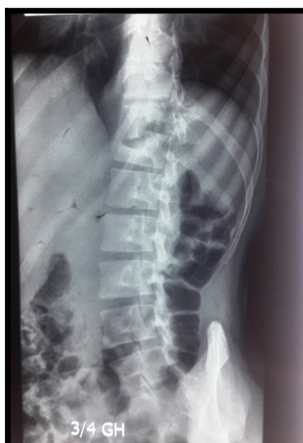
Figure 3. X-ray of the spine showing destruction of L4-L5 vertebral bodies.

Bacilloscopy on pus was negative; medium culture of Loweinstein Jensen identified Mycobacterium tuberculosis with resistance to Fluoroquinolones and Ethambutol. The diagnosis of TB Pre XDR Pott's disease was confirmed. HIV serology was negative. He was treated with similar therapeutic regimen like the first patient. The evolution was marked by the disappearance of symptoms and parietal postoperative cicatrization wound biopsy after 20 months of treatment ( Figure 5 ). Adverse effects were minor with rash of the face; there was no QTc elongation. Post-treatment X-ray revealed bone consolidation. The treatment was started on November 24, 2015 and ended on July 24, 2017.