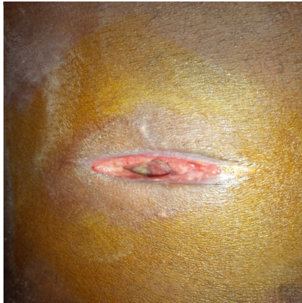
Figure 4. Showing the wound of the surgical incision after drainage of the periosteal abscess right parietal dorso leaving the source of the caseum.