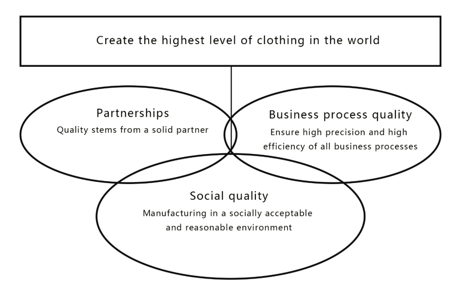
Figure 1. The three standards of quality management system.

Foxconn has become very dependent on Apple Inc for its agency production, Uniqlo is no exception, because Uniqlo is directly involved in the management of its direct-stores, the company's demand for products is very large, the large