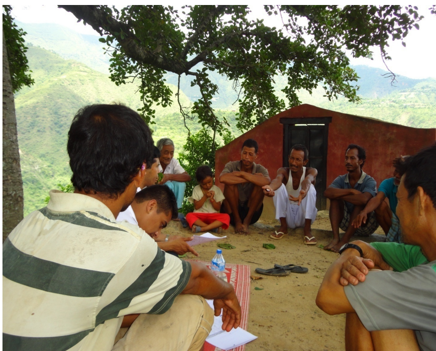
Photo: Focus Group Discussion with Village Representatives (Male group) at Sitalpati VDC-2 of Sindhuli district