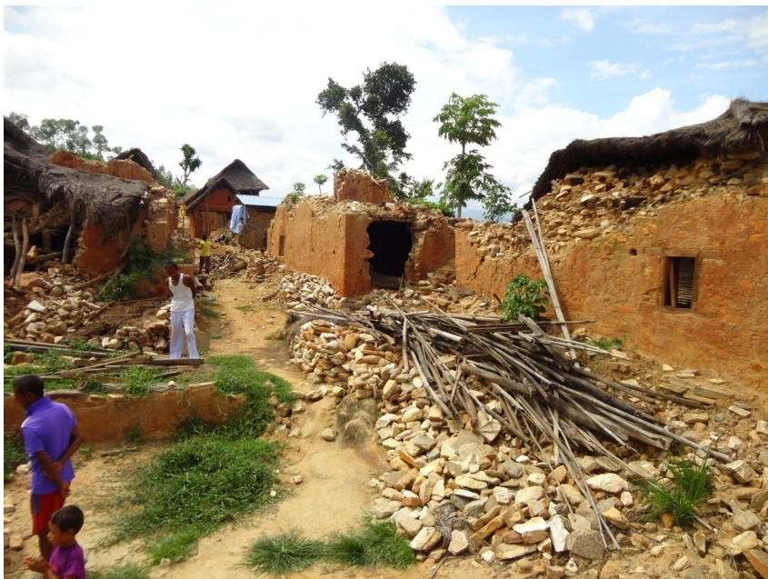
Photo: Completely Damaged Private Houses at Basheswor-9, Dadagaun of Sindhuli District.

reflects the loss and damage of private and institutional houses in the study area [13].