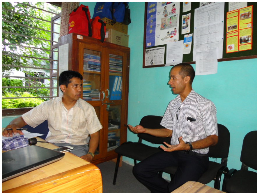
Photo: KII with DDRC member at DDC office of Sindhuli District

For rescue and relief, the DDRC has mobilized Nepal Army, Nepal Police force, Armed Police force (for 24 hours), civil serviceman, other government officials and institutional partners/district line agencies as well as non-state actors in the earthquake affected areas. He added that DDRC has followed government one door policy for the distribution of relief package and made 12 clusters for relief package distribution. The government has distributed NRs 15000 for each family who lost house and NRs. 140000 for member of the death family. However, the government has apportioned a budget to assist those who lost their livestock to the quake.