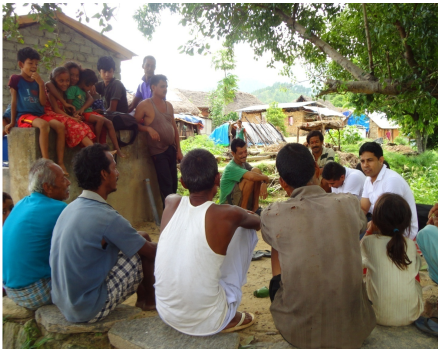
Photo: Focus Group Discussion with Village Representatives (Male group) at Sitalpati VDC-2

fear etc. children did want to go to school after earthquake. They reported that the role and contribution of INGOs, NGOs and other agencies is very poor. They did not face sexual exploitation and human trafficking in this area. “Internal displacement was not found here”, they said.