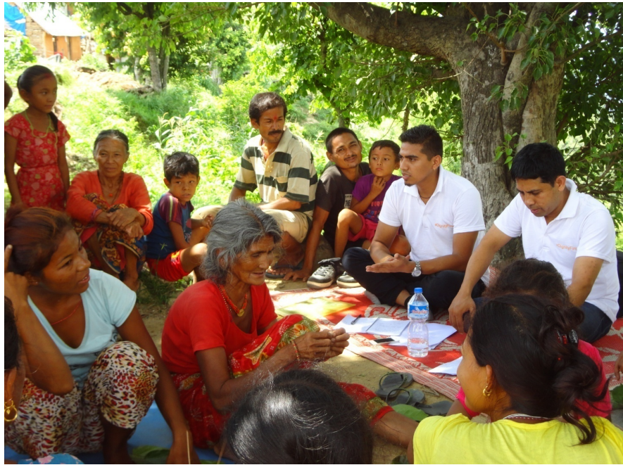
Photo: Focus Group Discussion with Mother's group at Basheswor VDC-9 of Sindhuli District

They did not cultivated peanuts this time because of earthquake hit. They are not returned in work completely until now because of depression and fear of earthquake. After earthquake, some of them reduced the cattle because of lack of farm house and they have experienced store room lacking for seeds and food storage.