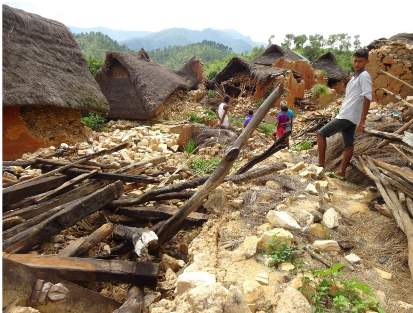
Photo: Completely Damaged Private Houses at Sitalpati VDC-2 of Sindhuli District.