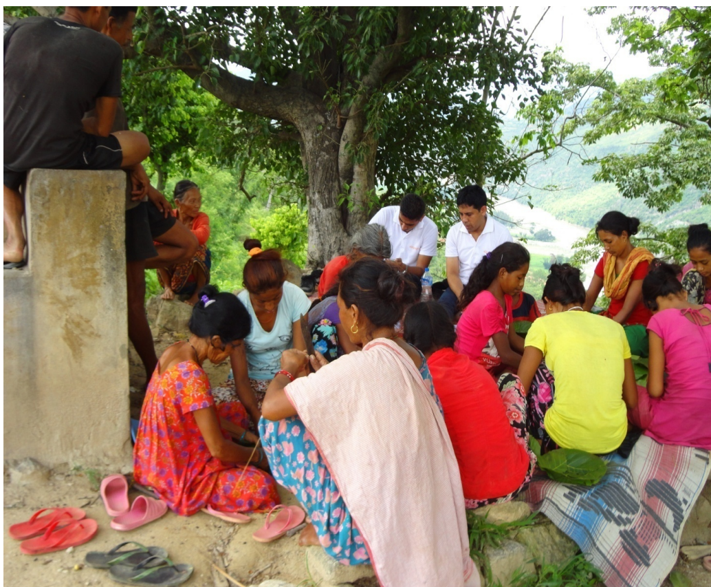
Photo: Focus Group Discussion with Mother's group at Basheswor VDC-9 of Sindhuli district

There was found two elderly women death and hundred percent houses were completely damaged by the earthquake. We continued our discussion and diverted them on rescue and relief package. They said we all got NRs 15000 from the government to make temporary shelter and death family got NRs 140000 too. They say, "All people utilized this money for shelter making especially to buy Zinc plate". The police force presented for support within 3 hours after earthquake. The police and army had supported to remove damage houses and to clean debris as well as shelter making, they said.