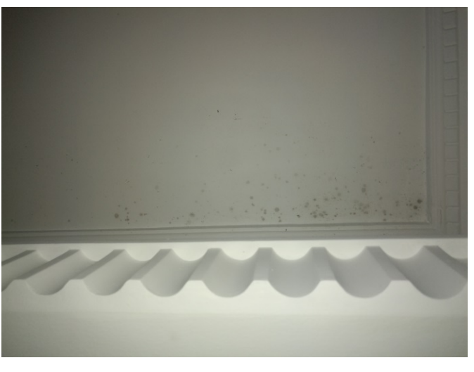
Figure 3. Mould under the ceiling in newly completed building.

The heat and moisture transfer are simultaneous and coupled each other. When the relative humidity of wall inside or surface reaches the critical condition, there will be a great mould risk. In actual situation, the transfer process is more complex because of various effect factors, such as water leakage and air infiltration caused by wall crack, types of building materials and wall construction, the time-domain characteristics of climatic geography, and the different building functions and live requirements, all of these may change the position of mould growth and reproduction [33]. In addition, the moisture accumulation inside the wall caused by the poor construction quality is easy to cause greater mould risk in a short time after construction ( Figure 3 ).