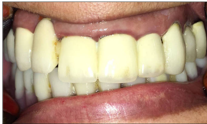
Figure 2. Periodontal changes with anterior fixed appliance.