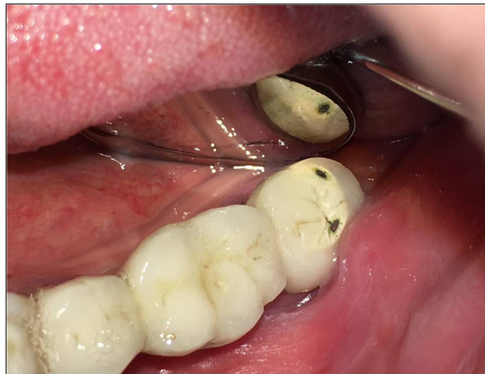
Figure 3. Periodontal changes with posterior fixed appliance.

disability, or their restricted access to oral care [32]. Patients with disabilities worth the same chances for oral and dental services as normal patients, in particular the disabled patients who were receiving fixed partial denture. So the aim