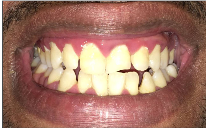
Figure 1. Periodontal changes of control case.