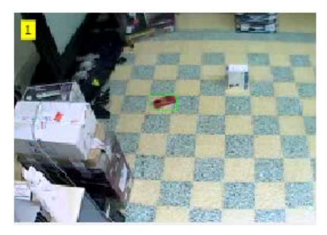
Figure 5. The car is detected buy the algorithm.

moving vehicles and produces a good performance due to the elimination of noise which now makes the blob analysis to produce a precise delineation to each of the vehicles. The result of the simulation shows the effectiveness of the proposed method.