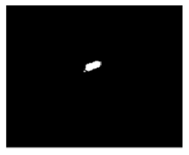
Figure 4. The Gaussian Noise is cleaned by the Morphological filtering.