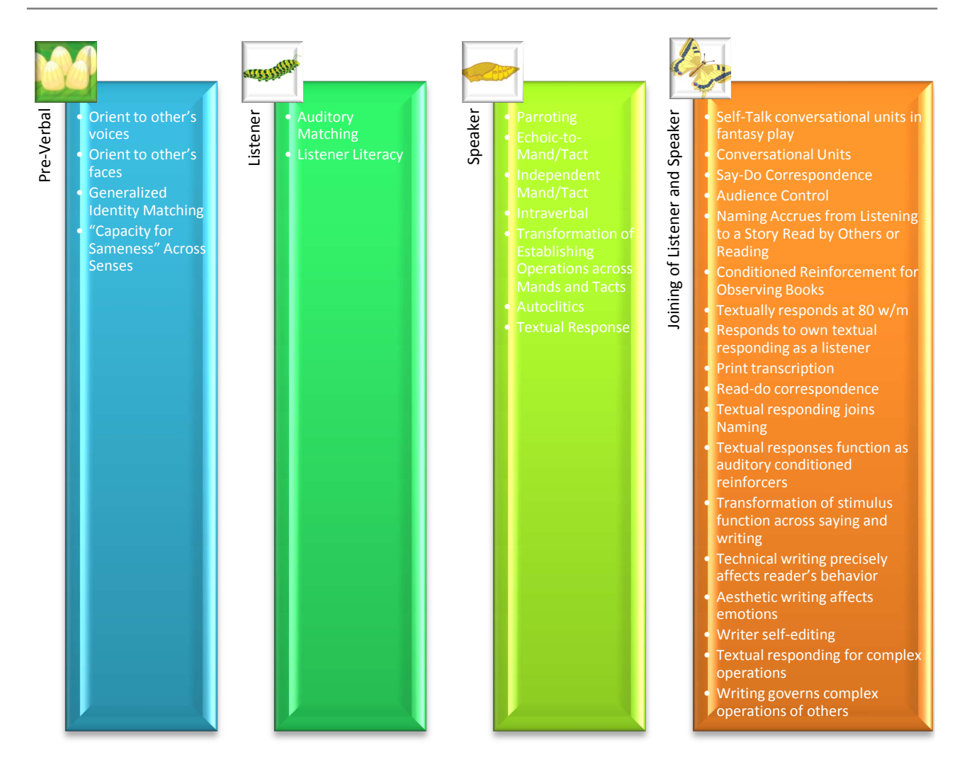
Figure 2. Four verbal behavior developmental metamorphosis stages.

new reinforcers and consequently lead to verbal development. Examples include a protocol to condition adults' faces and voices for observing adults, resulting in faster rates of learning [37], and a conditioning protocol to establish print as reinforcement for observing, resulting in generalized visual match to sample [38] [39] [40]. These latter cusps are pre-verbal foundational cusps as shown in Table 1, with the research-based protocols to induce them. Pre-verbal foundational cusps typically occur in utero and infancy but are found missing in children with severe developmental delays.