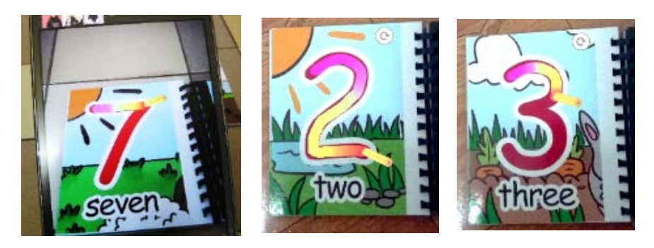
Figure 4. The demonstration animation in motion.

constant visual reference. Auditory learners appreciate music, thus justifying the use of an upbeat background music. The animated pencil is theorized to address the needs of kinaesthetic learners for movement. Additionally, they can point and trace the animated pencil throughout the demonstration.