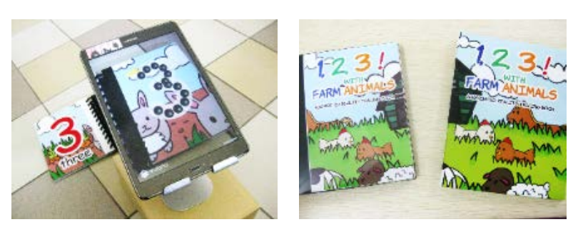
Figure 2. The system prototype which consists of the mobile application and book.