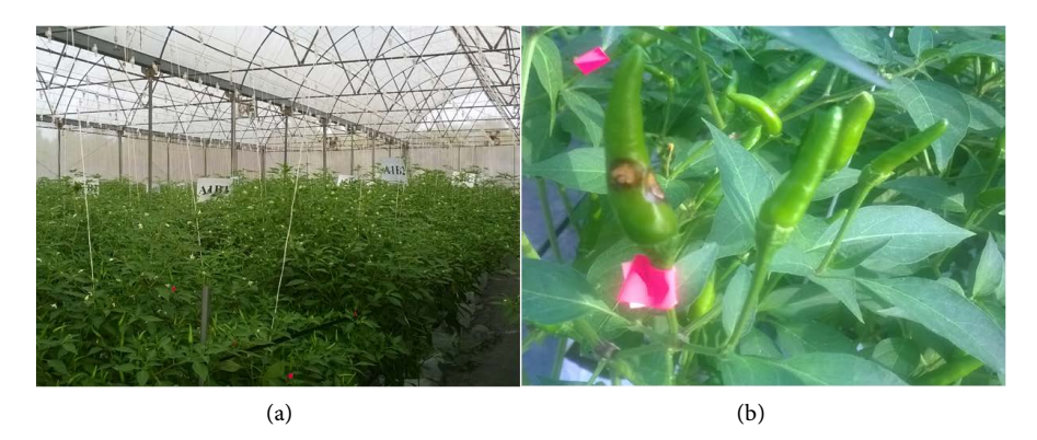
Figure 3. Photographs of chili plants in greenhouse (a) and symptom of anthracnose disease on chili fruit caused by C. gloeosporioides fungus (b).