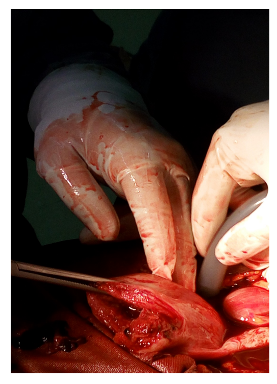
Figure 2. Exploration of uterine lesions during surgery (1).