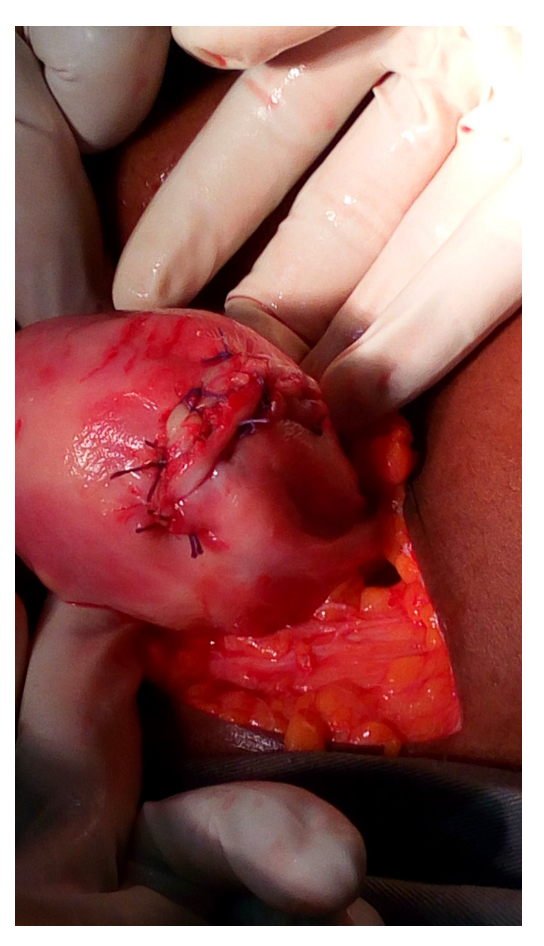
Figure 1. Appearance of uterus after conservative treatment.