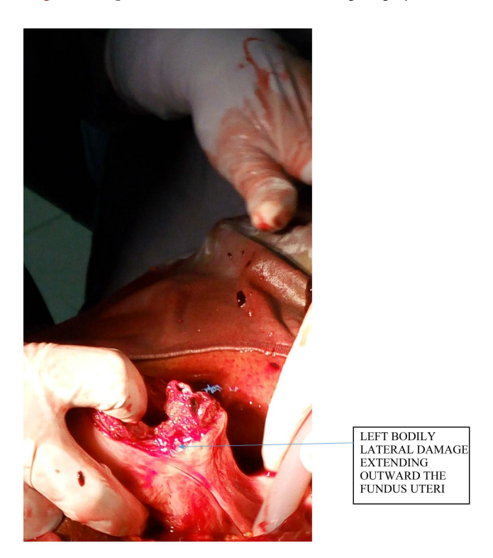
Figure 4. Exploration of uterine lesions during surgery (3).

There were no associated lesions of pelvic organs.