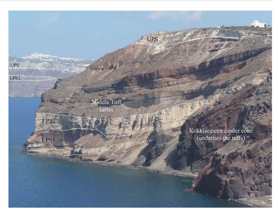
Figure 2. The cliffs of southern Thera island (Cape Loumaravi). The LPS2 is clearly not the same layer as the UPS plastered lower down the cliff surface, as proposed in [1]. It is a much older unit. Tuffs of the intervening Middle Tuff series clearly overlie the LPS2; this is especially clear at the headland, and indeed at innumerable three-dimensional outcrops all around southern Santorini. The apparent offset of the base of the LPS2 in the middle right of the photograph is due to perspective effects, not faulting.

excavation site because it is deeply buried at that location, below the tuffs of the Middle Tuff series that underlie the UPS. The only evidence provided in [1] to support the authors' statements referring to "archaeological evidence of Cycladic objects at several localities under the so-called LPS" is anecdotal. The claimed discovery of a Cycladic house some way down the caldera cliff at Balos is very interesting. If confirmed by detailed archaeological excavation, it would indeed show that that part of that cliff already existed prior to the LBA eruption. However, it does not in any way bear on the origin and age of the LPS.