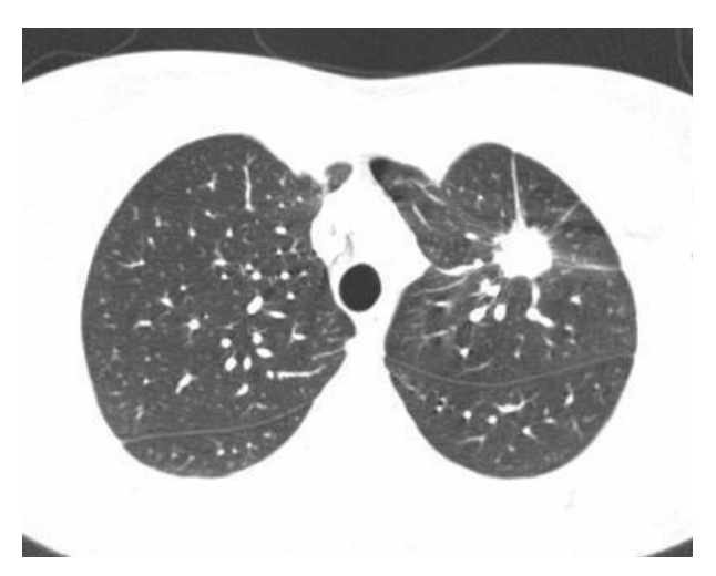
Figure 1. Chest CT showing the left upper lobe mass.

percutaneous biopsy of the lung or bony lesions or a surgical lung biopsy, were discussed and the patient opted to proceed with surgery. The patient had a left video-assisted thoracoscopic segmental resection of the left upper lobe mass, and pathology confirmed the mass to be a 2.2 cm moderately differentiated adenocarcinoma. Clinical, pathologic and radiographic studies classified the patient as Stage IV non-small cell lung cancer. Post-operatively the patient complained of an unusual amount of nausea and intense headaches. Her neurologic exam remained normal, a magnetic resonance imaging (MRI) of the brain obtained at this time was normal. Her symptoms improved with anti-emetics and a change in pain regimen and she was discharged home after chest tube removal on post-operative day three.