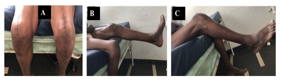
Figure 3. Functional evaluation at 8 months post-operative (A) knees flexion; (B) and (C) left and right residual flessum.