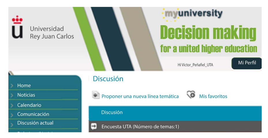
Figure 7. Survey of graduates.

show that integration among students was good and that the relationship with the teachers has been very good. Then, in the evaluation section of the students' process, the graduates believe that the school administration only partially assists teachers to obtain materials for the School of Medicine. Emphasizing the belief that the main concern of the school administration was rather to solve administrative problems. Finally, regarding the facilities of the Faculty as in comfort, lighting, classroom, etc. was good. As for the library, they point out that it is not suitable. Finally, we present the results of the satisfaction survey.