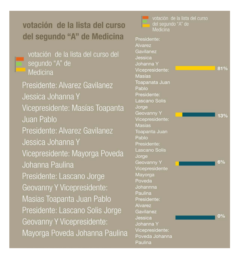
Figure 5. Results of the electoral process.