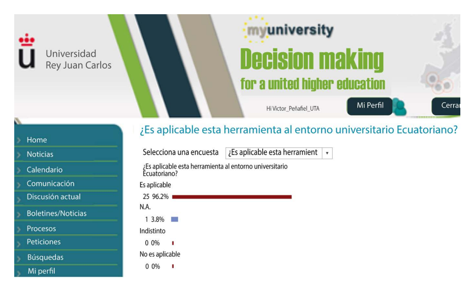
Figure 3. Results of the debate.

The remaining percentage is distributed among the other participating bino-