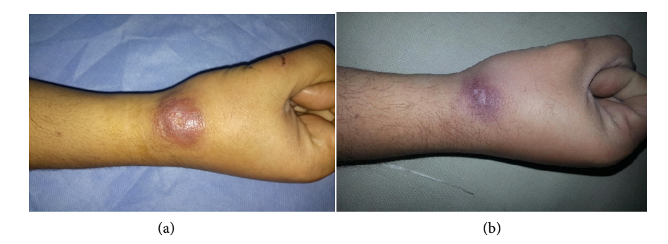
Figure 3. Thirty five years old male with cutaneous leishmaniasis on the right wrist. (a): Before treatment, (b): After 4 weeks treatment by 40% Loranthus europaeus ointment.

There were no significant difference in the grades of responses in relation to the durations in the treatment between group A and group B, were: