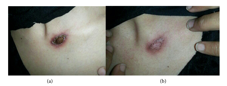
Figure 2. Forty years old female with cutaneous leishmaniasis on the chest (a): before treatment, (b): after 4 weeks treatment with 25% topical podophylline solution.