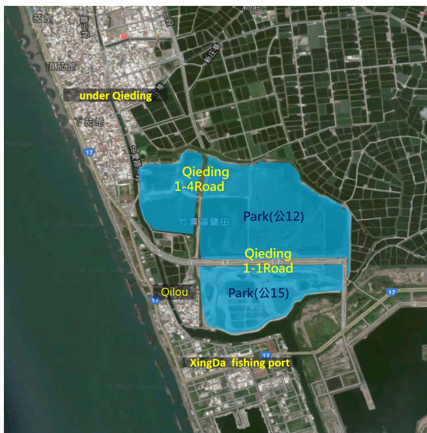
Figure 2. Association between Qieding 1 - 4 road and the wetland.

With the structuration theory in Section 4, it is assumed that people and the environmentalist groups have reached an agreement, and there is the multiplication effect for the system in terms of cooperation for the ecological settlements and road development. If the power intervention of economic or political force is introduced, the effect will be reduced or even work against the system; i.e. the system is challenged by the comments from both the positive and negative sides. If legislation and standard procedures are followed for the review of the 1 - 4 road development, the system of the 1 - 4 development will remain unchanged due to the balance between the positive and negative comments. Policy-wise, the Qieding 1 - 4 road will remain undeveloped and active.