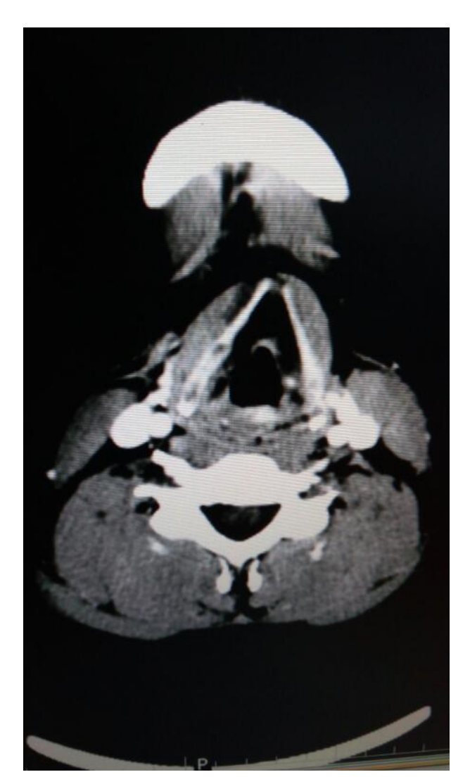
Figure 2. Contrast enhanced CT scan.

CO_2 laser is treatment of choice and Lucien et all successfully treated 5 out of 6 patients with supraglottic haemangioma with CO_2 laser [7]. We have treated our