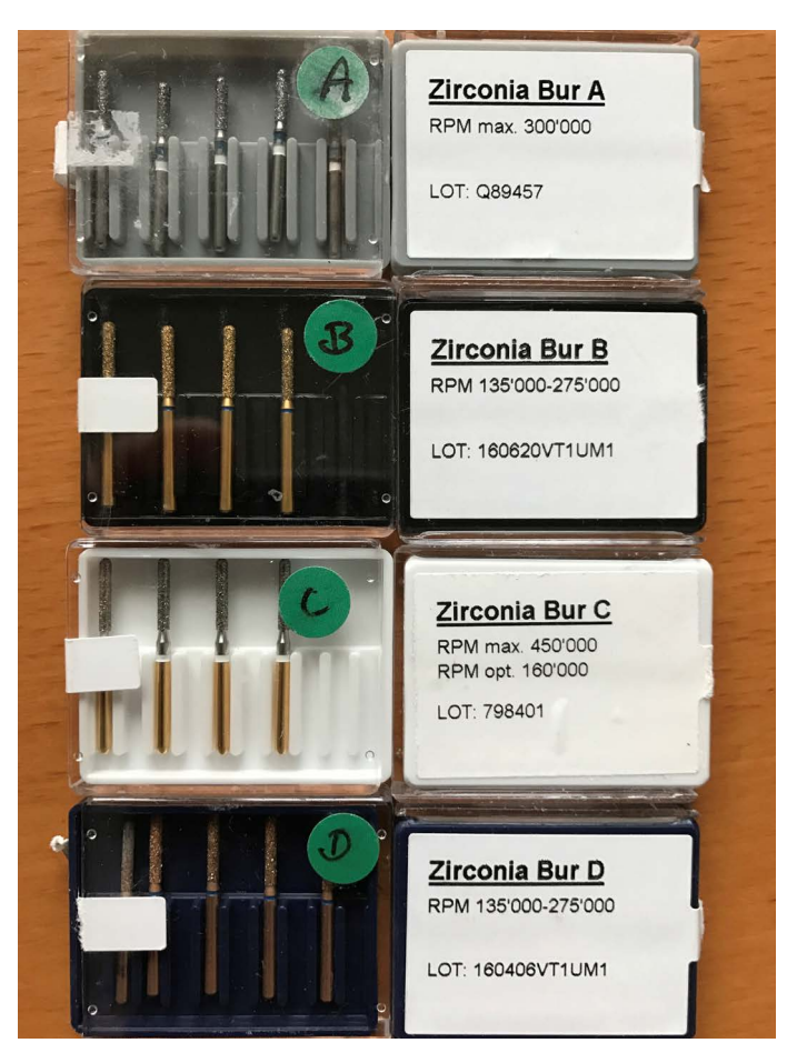
Figure 1. An example of the 4 used burs for the evaluation.

Advice was given to cut 1 mm deep grooves into the zirconia using the side of