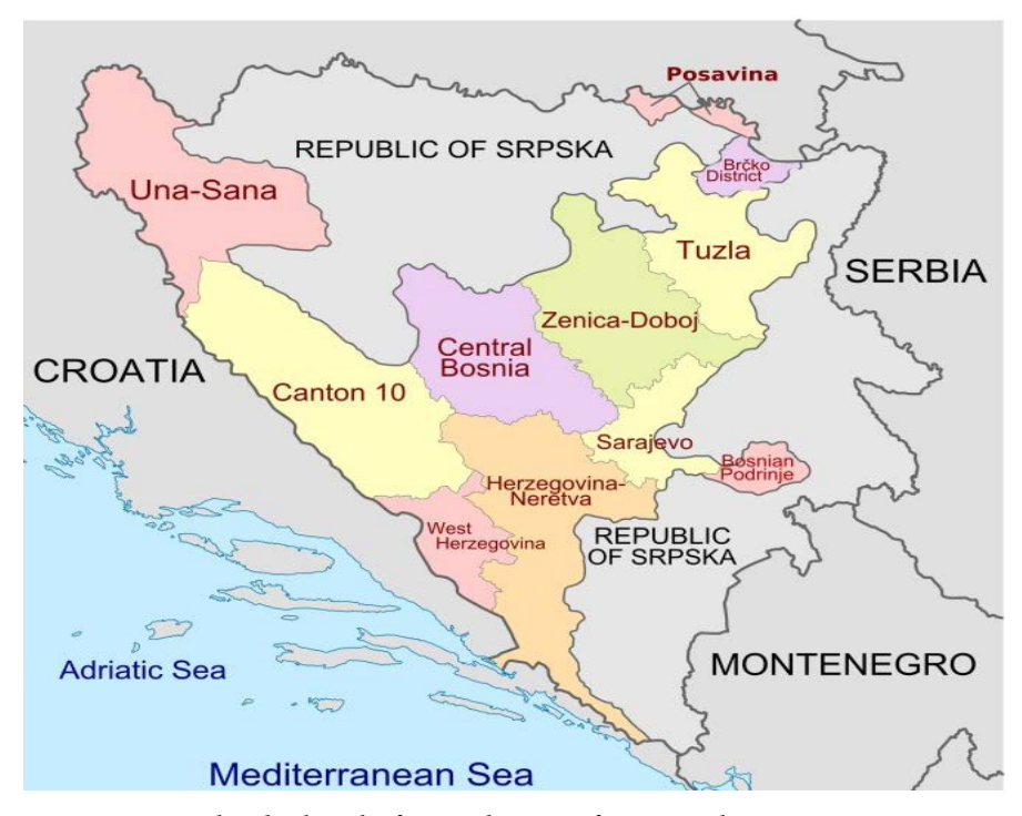
Figure 1. A map that displays the fractured nature of Bosnia and Herzegovina.

According to Annex 4 of the General Framework Agreement for Peace<sup>4</sup>, Bosnia and Herzegovina is established as an asymmetric state consisting of two entities, i.e. federal units, the Republic of Srpska and the Federation of Bosnia and Herzegovina, and a local government under the direct sovereignty of Bosnia and Herzegovina called the Brčko District of Bosnia and Herzegovina ( Figure 1 ).