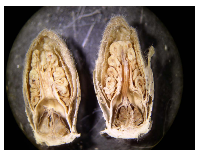
Figure 2. Cross section of cotton flower bud showing rot of ovary wall and damage to anthers following exposure to laboratory reared cotton fleahoppers.

mm), all were blighted and killed and 21 abscised with 27 retained on the plant. Fourteen of 29 large flower buds (3 to 7 mm wide) died and abscised. Bacterial concentrations from squares that remained on the plant ranged from 10^5 - 10^8 CFU/g tissue on TSA regardless of size. Protuberances from insect feeding or ovipositing appeared on fruiting branches, leaves and flower petals. Abscission was consistently associated with necrosis and damage of the ovary wall ( Figure 2 ). This symptom in abscised squares has been reported previously [25] [26]. Both abscised and retained buds showed necrotic spots among the anthers or on the stigma and style and are considered diagnostic for square abscissions caused by fleahoppers [25] [27]. Damage to the ovary, however, appeared to be most critical for inciting abscission. These results suggested that perhaps opportunistic bacteria are transmitted vertically ( i.e. , from adult to egg), and thus more advanced lab-reared generations are required to produce cotton "pathogen-free" insects, or a range of bacteria are capable of rotting buds. We are currently exploring each of these possibilities.