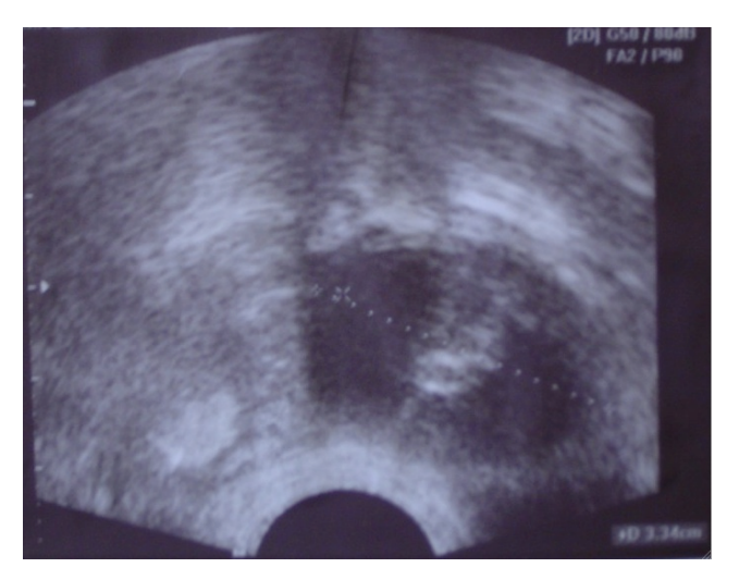
Figure 1. Transrectal ultrasonography showing a hyperechoic right laterorectal mass with posterior enhancement of central calcification.

The pathophysiologic process for the developpement of intraperitoneal free-floatting bodies has not yet been fully elucidated. However, it is generally agreed that peritoneal loose bodies arise from torsion and separation of appendices epiploicae from the antimesenteric taenia of the colon [1]-[3]. First, appendices epiploicae are subjected to torsion and subsequent infarction with inflammatory changes related to peritoneal