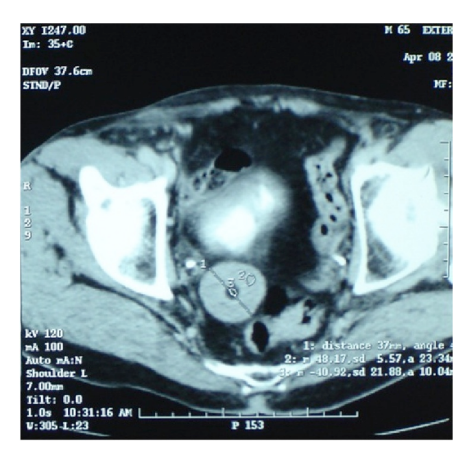
Figure 2. CT scan: oval well circumscribed retrovesical soft tissue lesion with a central negative density (–40.92 UH) and positive peripheral density (+48.17 UH) without enhancement.