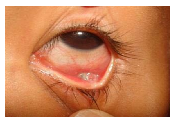
Figure 2. Foreign body seen in inferior fornix of left eye.