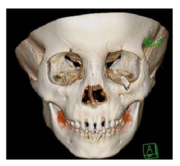
Figure 4. 3D bone reconstructed images showing the foreign body embedded in the left inferior orbital rim causing a fracture at the anterosuperior wall of the left maxillary sinus.