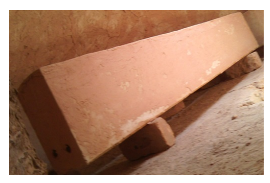
Figure 2. A view of a baked clay beam after firing in Potter's type kiln.