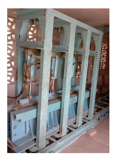
Figure 1. A clay beam is being cast and compacted in mechanized system.