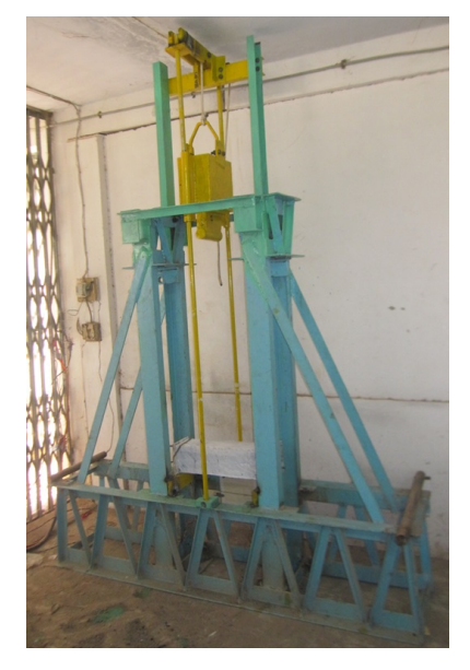
Figure 4. A reinforced baked clay beam of dimensions 150 mm \times 150 mm \times 500 mm is being tested for drop weight impact loading.

Three beams from each group were tested. The beams of each group showed similar