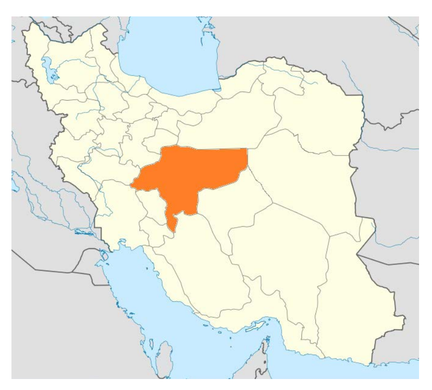
Figure 2. Study area (Isfahan city).

history and experience [5]. These include mainly, countries that have already established health tourism industries, such as Germany, USA, Japan, UK, France and Italy.