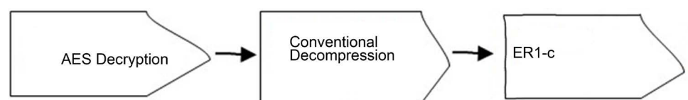
Figure 3. Decoding process of PMU data using ER1-c.