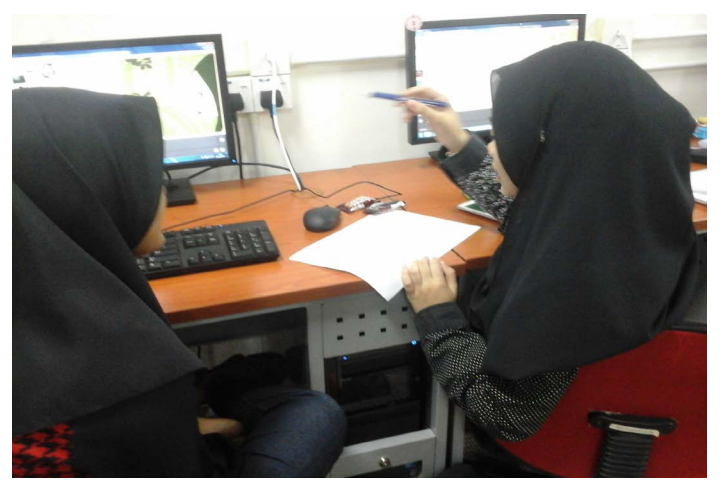
Figure 3. Students work collaboratively upon completing the task.