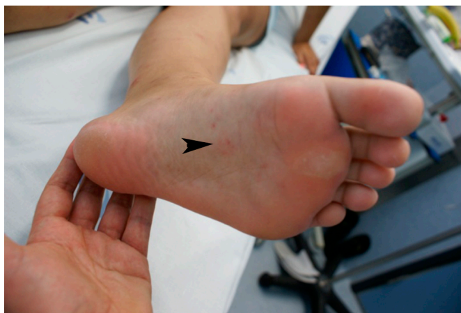
Figure 2. Case 2, petechial lesions localized to the soles.