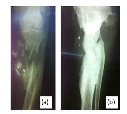
Figure 1. Tibial bone loss treated by inter-tibiofibular graft (ITFG) (a) initial lesion. (b) consolidation after graft.

used this technique in 14 of our patients who had sepsis after the initial debridement. Inter-tibiofibula graft (ITFG) [8] was necessary to achieve consolidation in 3 patients (Figure 2). The graft donor site was dominated by the iliac crest 26 cases against one taken at the expense of the anterior tibial tuberosity.