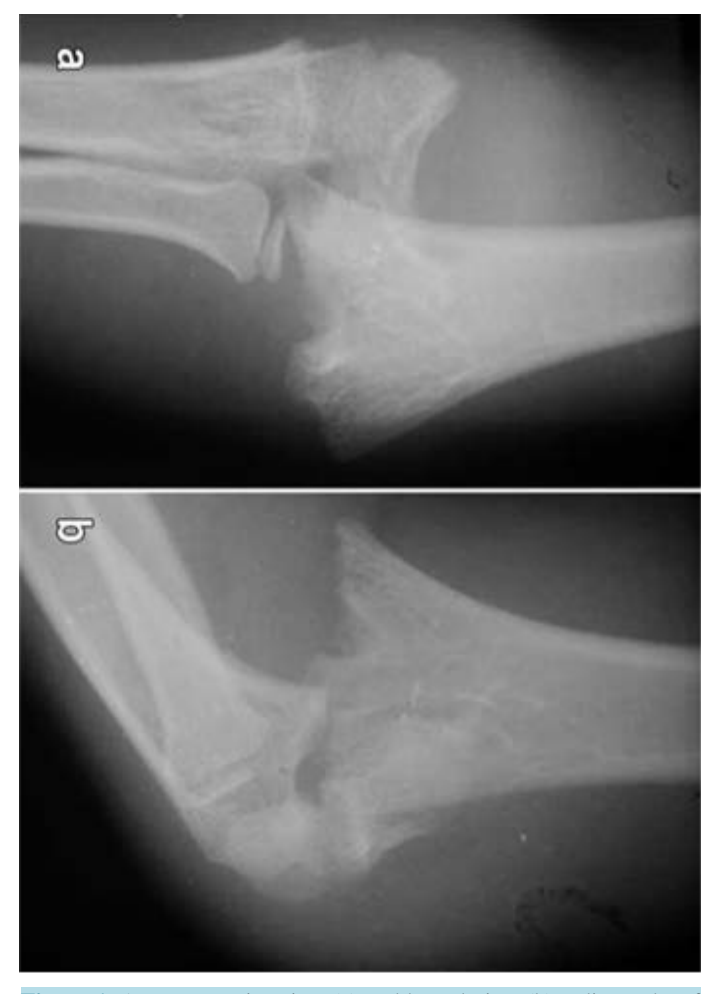
Figure 1. Anteroposterior view (a) and lateral view (b) radiographs of the elbow showing a posteromedial displaced type 4 supracondylar humeral fracture.

The follow-up after 12 and 48 months showed good functional results according to the Flynn [10] criteria and complete neurologic recovery.