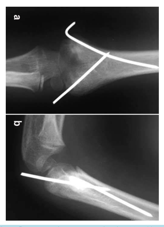
Figure 5. Post-operative anteroposterior view (a) and lateral view (b) radiographs of the elbow showing a reduced fracture with K-Wire internal fixation.