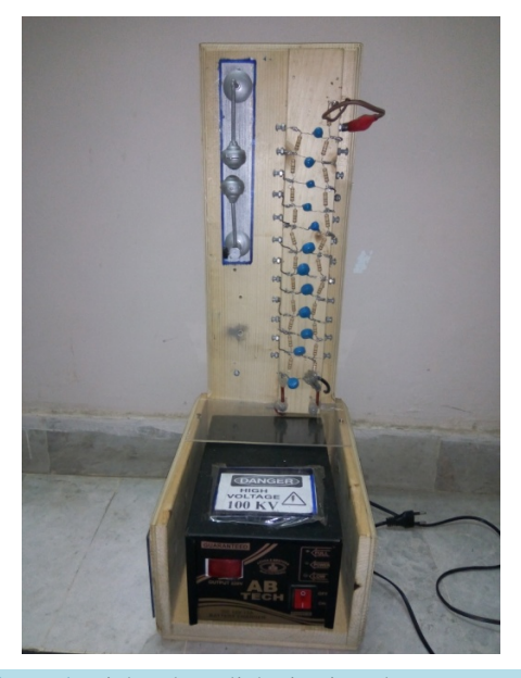
Figure 1. High voltage lightning impulse generator.

Seen from Figure 3, the standard impulse waves are usually defined by its peak values. Impulse Voltage waveform is illustrate by rise time namely T_1 the fall time namely T_2 . The rise time is illustrated as 1.2 µs and the fall