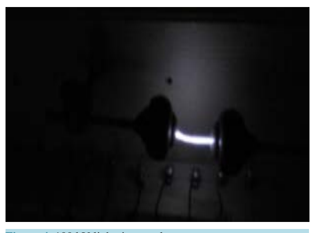
Figure 4. 100 kV lightning spark.

Power engineers developed numerous devices to control the induced damages due to lightning but they are still useless due to lot of reasons. One of the reasons is periodically testing of protective devices before and after installation in practical environment. As actual lightning produces high over voltage so I fabricate high voltage