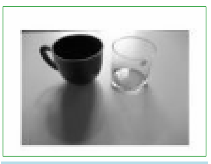
Figure 1. The photograph used in the tests

An assessment form was designed to support the analysis of the children's expressions. The form was based on the whole (i.e., 1) a shadow is constituted by the absence of light) and on the identified parts (i.e., 2) light source, 3) light source emitting light particles/rays, 4) direction of light, and 5) light being obstructed by something/transparency of the light-hindering material). The form was based on the five qualitatively different ways