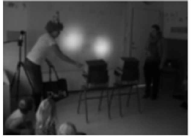
Figure 3. The lightboxes.

we, again, had taken for granted that the children should discern aspect of the direction of light by themselves.