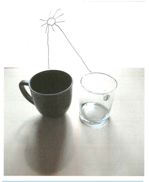
Figure 5. Lisa's post-test drawing.