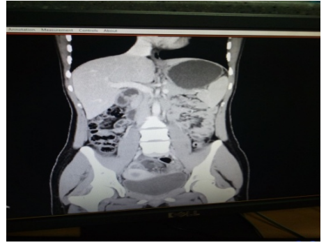
Figure 1. CT axial and coronal view of two different patients in our study; one presenting with bilateral adnexal cystic lesions and the other with right adnexal mass.