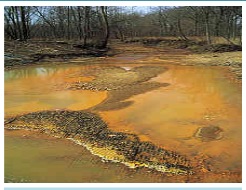
Figure 5. Acid mine drainage.

Meanwhile, planning the mining layout so as to have the least requirement of the forest land and take necessary steps for reclamation of the mined out land so that the forest land taken for mining purposes can be brought back to forest.