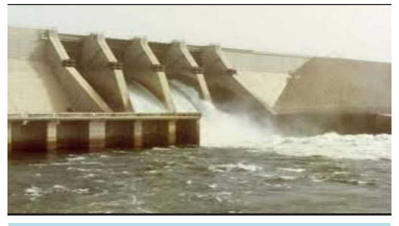
Figure 4. Kainji-dam.