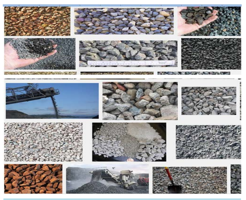
Figure 3. Rock aggregates and quarrying (modified from Adekoya, 2003).