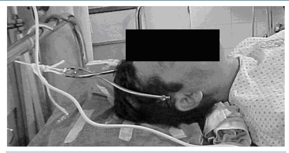
Figure 1. Patient treated by a slow traction over a low friction surface using Cone's caliper.

team was instructed to stop the traction procedure if any evidence of neurological deficit appears, suggesting the neural canal compromise by a protruded intervertebral disk or bony spicule that might appear following this type of injury. Since no neurological deficits were detected before and during the traction procedure, the traction protocol was carried out without interruptions or a need for additional imaging procedures, e.g. CT scan or MRI scan, in all the studied patients.