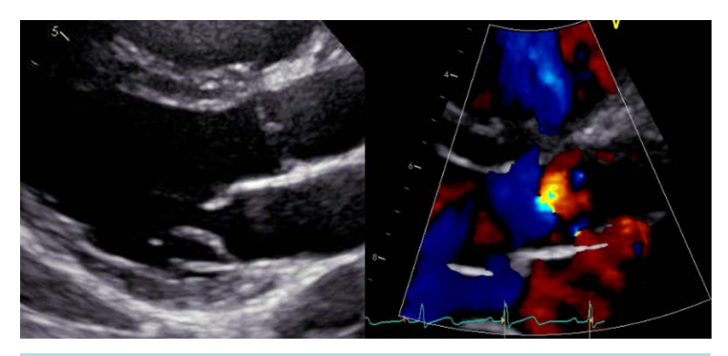
Figure 4. Transthoracic echocardiography performed at 1 year showed only trivial aortic regurgitation without annular dilatation.

Figure 3. The autograft was placed inside the prosthetic graft and both the proximal and distal ends were fixed with a running suture of 4-0 Prolene. This figure shows that the reinforced autograft construct was connected to the aortic annulus with a running suture of 4-0 Prolene to complete root replacement.