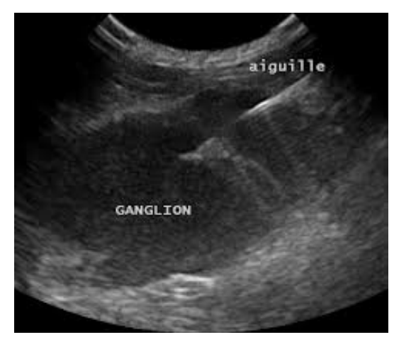
Figure 1. Ultrasound image of a deep abdominal lymphadenopathy.

The tuberculin skin test was phlyctenular. A chest radiograph was normal. The search for Mycobacterium tuberculosis was negative in the liquid sputum and urine. A lymph node biopsy was performed which pathological examination showed epithelioid granulomas with giant cell caseating confirming the diagnosis of lymph node tuberculosis ( Figure 2 ). Antituberculosis quadruple therapy pyrazinamide (1800 mg/day), isoniazid (300 mg/day), rifampicin (600 mg/day) and ethambutol (1500 mg/day) was established for a period of two months followed by two drugs (isoniazid 300 mg + rifampicin 600 mg) for four months. The total duration of tuberculous treatment was six months. With treatment, the outcome was marked by the disappearance of lymphadenopathy and signs of tuberculous impregnation. Antiviral treatment was continued until the 96th week still undetectable viremia. Stock control six months after cessation of antiviral therapy was marked by early relapse with viremia to 273 IU/ml (2.44 log).