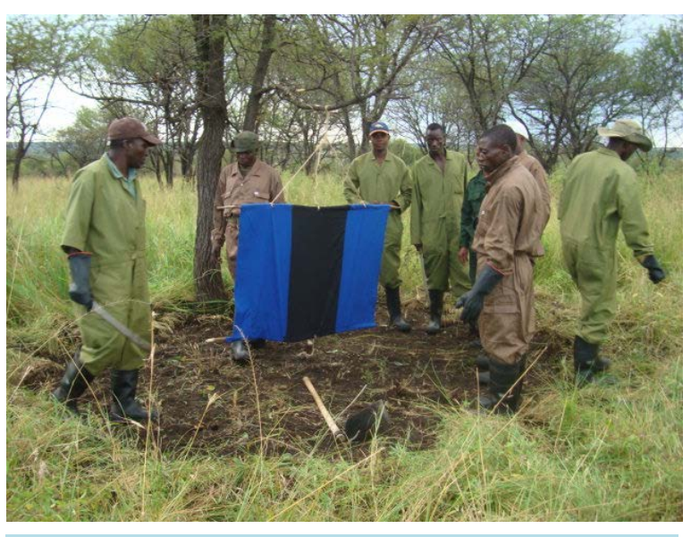
Figure 1. Insecticide Treated Target deployment in the field.

Monitoring tsetse control is essential to decide upon the most effective control strategy. Among the different types of the tsetse fly traps available, the preferred traps by TANAPA are Biconical [18] and NGU [19]. Retaining traps particularly biconical are interspaced with ITTs at every 200 m in order to monitor changes in tsetse density and distribution over time. This is essential as one measure of the effectiveness of HAT control efforts being undertaken by targeting the vector. Monitoring traps are emptied after every 24 hours during the pre control phase for two days and or after every one week during the control period for six month. However for comparison purposes, data from the control phase was collected for two days.