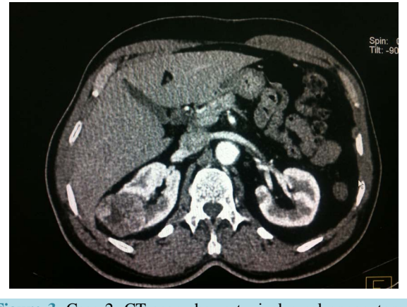
Figure 3. Case 2: CT scan shows typical renal oncocytoma as a right renal tumor with heterogeneous density and a central hypodense stellar scar, localized at the posterior portion of the upper pole, whose diameter was 6 cm.

cytoma are relatively isoechogenic or slightly hyperechogenic compared to adjacent renal parenchyma [8] [9].