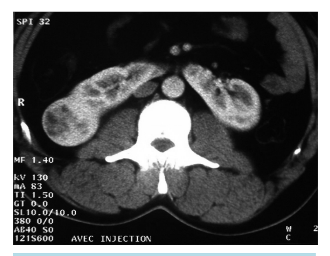
Figure 1. Case 1: CT scan shows a rounded tumoral process of 4 cm in diameter with a central hypodense beach, occurring on a horseshoe kidney presenting the same dynamic of enhancement that of adjacent normal renal cortex after injection of iodinated contrast.

Ultrasound highlighted heterogeneous hypoechogenic solid mass of the upper pole of the right kidney of about 6 cm maximum diameter with moderate vascularization at Doppler color. CT scan concluded of a right