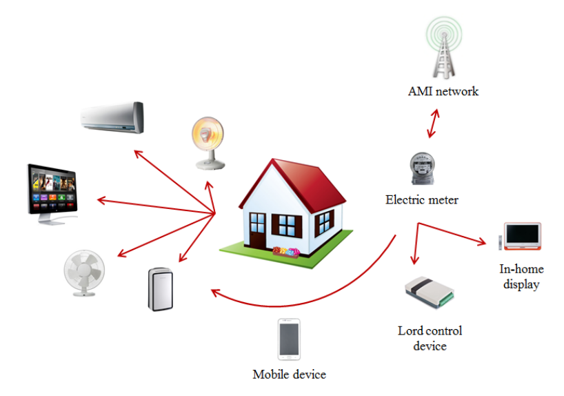
Figure 1. Smart grid architecture.

With the development of standardization in SEP2.0, it has been proven to be compatible with multiple network technologies. There is rapid development of this SEP2.0 in the United States. To promote smart grid standardization bodies (National Institute of Standards and Technology, NIST) and to develop wireless communication