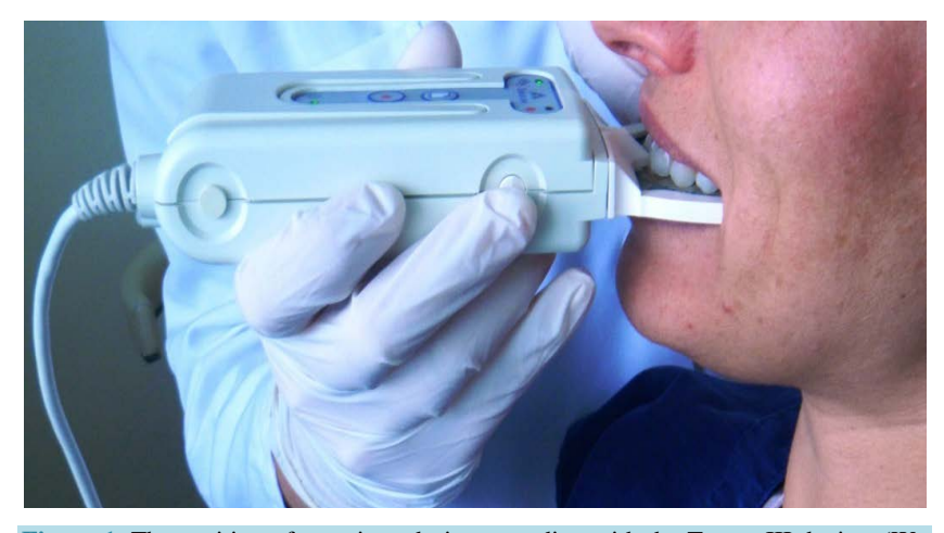
Figure 1. The position of examinee during recording with the T-scan III device. (We obtained written consent for publication of their image from person in the picture).

Occlusal force, presented by percentage (automatically by the T-scan electronic system) was analyzed in relation to a preferred chewing side. The T-scan sheets (sensor) used, have a layer thickness of 100 \mu m and are therefore within the range of commercially available articulating foils, papers and silk (8 - 200 \mu m).