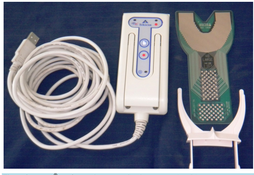
Figure 2. Tscan (<sup>®</sup>) III from Tekscan Inc., South Boston, MA, USA.