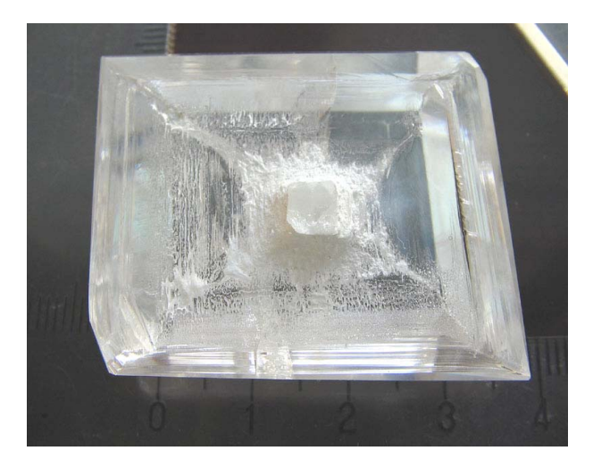
Figure 1. The as-grown KLuW crystal with seed orientations along b directions and severe cracks along a and (a + c) directions.

crystal. Figure 2(a) shows the melt inclusions observed at the edge of the (110) face and we can see that they are large size up to hundreds of microns in length. They may be caused by the rapid cooling-rate during the last stage of crystal growth, the segregation phases formed in the system, or the multi-steps' meeting in the developing process. In addition, we suggest that the negative crystal, which is formed by the negative growth, has been formed in the melt inclusion shown in Figure 2(b) due to its regular morphology as the same of the crystal. On the other hand, the inclusions can also be caused by the impurities and insoluble particles. Figure 2(c) shows the inclusions containing insoluble particles with micrometer scale observed on the (200) faces. They often result in the step bunching and so high-purity materials should be selected to avoid impurities and insoluble particles. The inclusions described above are often symbiotic in the crystal during crystal growth. However, when the temperature