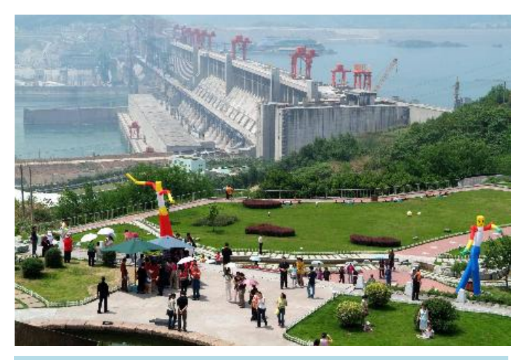
Figure 4. The Three Gorges Dam attracts travelers from around the world.

warmer climate to live through the winter. Most of the rare and endangered species of plants are distributed in the areas above 300 meters of the sea level, which is far above the maximum flood level [13]. Also, it is fortunate that only few rare and endangered animals inhabit areas that will be inundated by the reservoir. A study shows that the construction of the Three Gorges Dam will have no adverse effect on the living conditions of the Chinese dolphin and Yangtze alligator. In terms of water control, the reservoir will regulate water storage and discharge for navigation needs. Thus, downstream flow will be increased during the dry season, but without causing any change in the underground water level. Therefore, the swamp process of the valley will not be aggravated [4]. According to the design, the reservoir is expected to store water in October, which will result in reduced downstream flows. Note that in years of ordinary water flow, the river's flow is still higher than necessary to control the salt content in the Shanghai area. During periods of low water ( i.e. : when sea water makes its most serious inroads), the increase in regulated flows by the dam will have the obvious effect of diluting salt