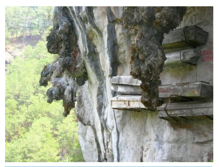
Figure 6. The famous hanging coffins site high in the Shen Nong Gorge.

The construction of the Three Gorges Dam is without doubt one of the largest technological achievements in the 21<sup>st</sup> century. However, as with all technological implementations, there are advantages and disadvantages. On one