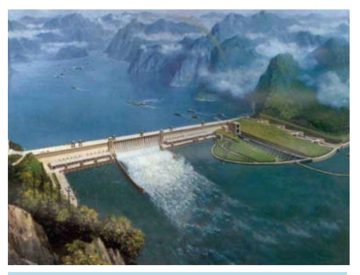
Figure 1. Schematic of the Three Gorges Dam.

It was during the 5<sup>th</sup> session of the 7<sup>th</sup> National People's Congress that the examination and debate on the feasibility of the TGP came to an end, and a new era to harness and to develop the Yangtze river was ushered in Figure 2 shows the unfinished building of the Three Gorges Dam.