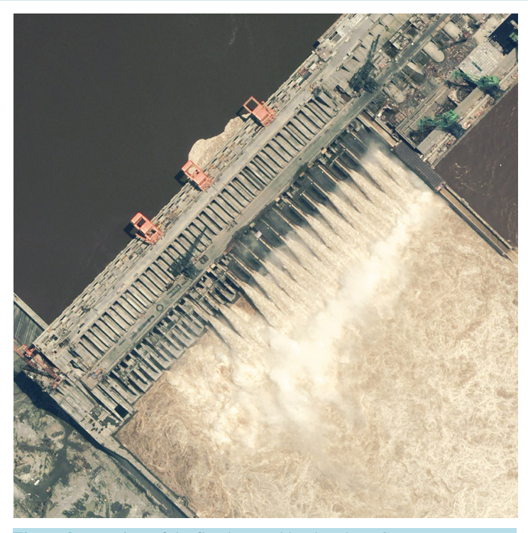
Figure 3. Top view of the flood control by the Three Gorges Dam.